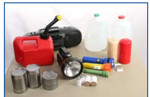
Hurricane Kit: Batteries, Radio, Water, Candles, Canned Food, Flashlight, Etc.

will co-operate with Hillsborough County Fire Rescue to the fullest extent possible while continuing to provide our community with necessary emergency medical services.